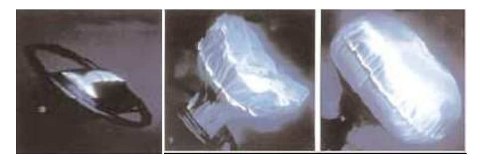
Fig 1. Airbag

Airbag was invented by John W. Hetrick and modified by David S.Breed in 1952 and 1967 respectively. Since then it has revolutionized occupant's safety. Car occupants form 64% of the total road casualties. An US study shows that about 3.3million airbags have been deployed, saving more than 6377 and preventing countless injuries.[14] An airbag is a occupant safety device. It is a type of occupant restraint system that consists of a flexible fabric bag, also known as air cushion. Designed to protect occupants in frontal crashes, airbags inflates in milliseconds after a crash is detected cushion that protects the body from the hard interior structures of a vehicle as it decelerates. Airbags are directly linked to the life of the drivers and the passengers, as they are used as last line of defense in a collision. Hence the proper functioning of system is vital. In order to obtain a precise and reliable airbag operation, a robust system has to be designed. It is estimated that in all crash scenarios, airbags deduce fatalities by 16% for unbelted drivers and 13% for belted drivers. Airbags are intended to augment the safety along with seatbelts. Airbag in conjunction with seatbelts are effective injury prevention device; however their deployment can introduce new injuries. [9]